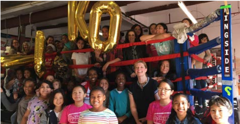
Toronto Foundation's Women In Philanthropy Bus Tour visits MJKO.

THE STOP helps families overcome the root causes of poverty and hunger through programs that build skills, health, hope, and community while maintaining dignity. One of Canada's first food banks, The Stop and has evolved over the years to provide not only drop-in meals, a food bank, and community kitchens and gardens, but also perinatal and family support, and effective civic engagement programs for marginalized, socially isolated and low income people in the Davenport West and Christie/St. Clair areas. www.thestop.org