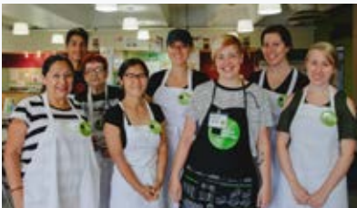
Volunteers at The Stop Community Food Centre

www.torontofoundation.ca/vital-conversations